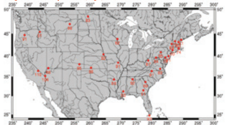
Figure 2: Max Temp Extreme (deg F) for 200004

Table 3 lists relative risk of specific types of failure during the sealant curing process by sealant type.