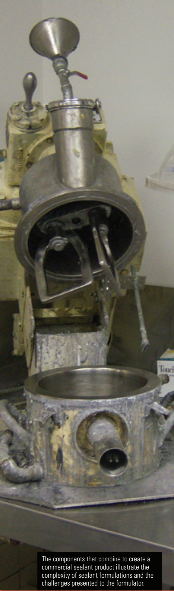
The components that combine to create a commercial sealant product illustrate the complexity of sealant formulations and the challenges presented to the formulator.