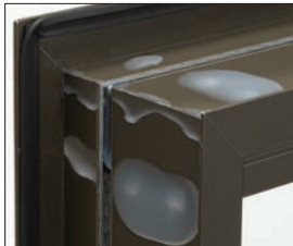
896 Self Leveling Silicone.

As window and curtainwall designs continue to evolve, improved methods for sealing around screw-heads, bolt holes, corner details and mechanical fasteners are critical. Utilizing a controlled flow silicone sealant instead of a non-sag version can reduce material usage, labor and cost by an average of 40% - with no tooling. Pecora is the industry leader for semi-self leveling sealants with 896-SSL and 896-TBS-SSL. These unique silicones infiltrate into all cracks ensuring a complete seal with no waste of material, shrinking or cracking while also providing excellent adhesion.