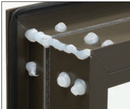
Traditional Non-sag Silicone.