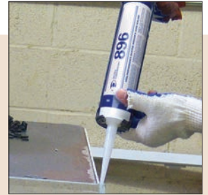
All 896 products are available in 10.1 ounce plastic cartridges and 50 gallon units