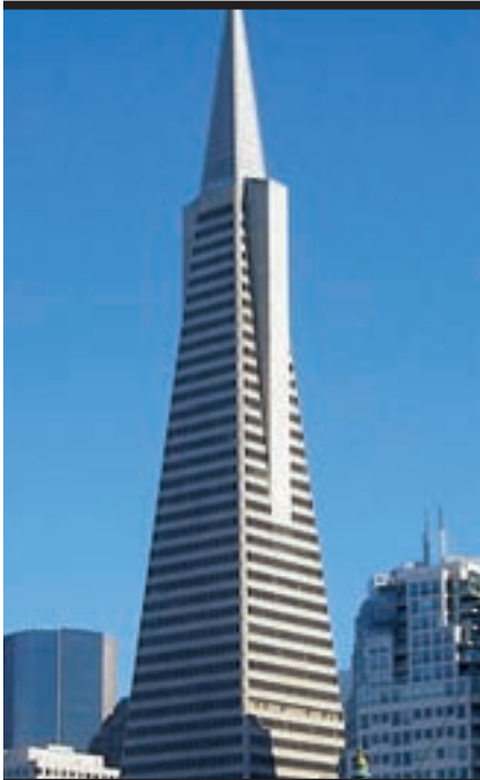
TRANSAMERICA PYRAMID SAN FRANCISCO, CALIFORNIA

The selection of the correct sealant is crucial to a building project and knowledge of substrates, surface treatments and application designs are all key elements to the success of a building's performance. Pecora's technical team is highly qualified to recommend the proper sealant and perform compatibility, adhesion and stain testing between Pecora's sealants and jobsite representative samples. Other services include project consultation, job-site inspections, structural glazing and shop drawing review, and warranty administration.