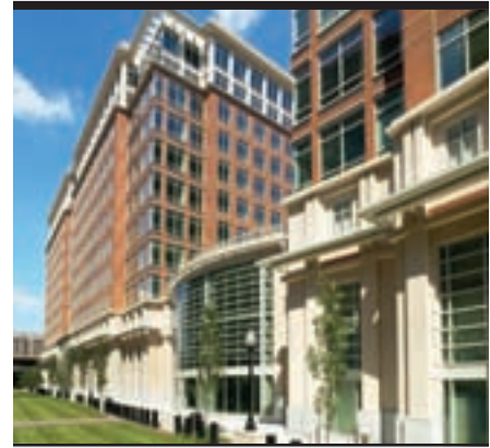
POTOMAC YARDS ALEXANDRIA, VIRGINIA

Proper sealant selection is an important consideration early in the planning stages of any construction project. This Product Reference Guide shows the capabilities and uses of Pecora sealant products while providing detailed information on specific applications and projects.