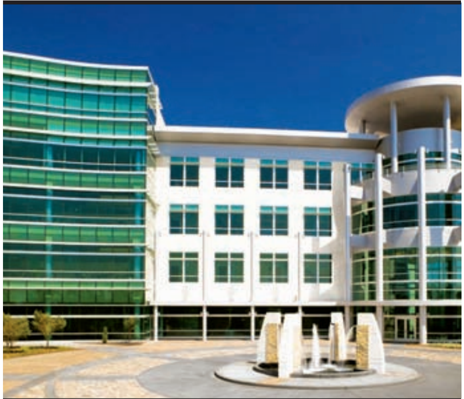
HUBBELL LIGHTING CORPORATE HEADQUARTERS GREENVILLE, SOUTH CAROLINA